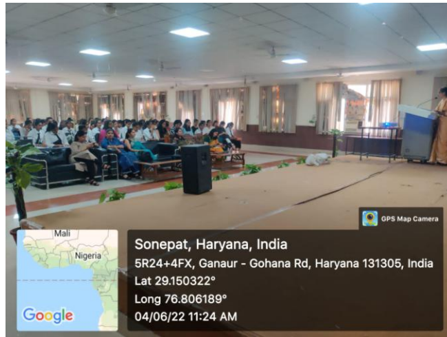
Discourse on Motor Vehicle Act: Implications and practical Challenges by Advocate Babita on June 04, 2022