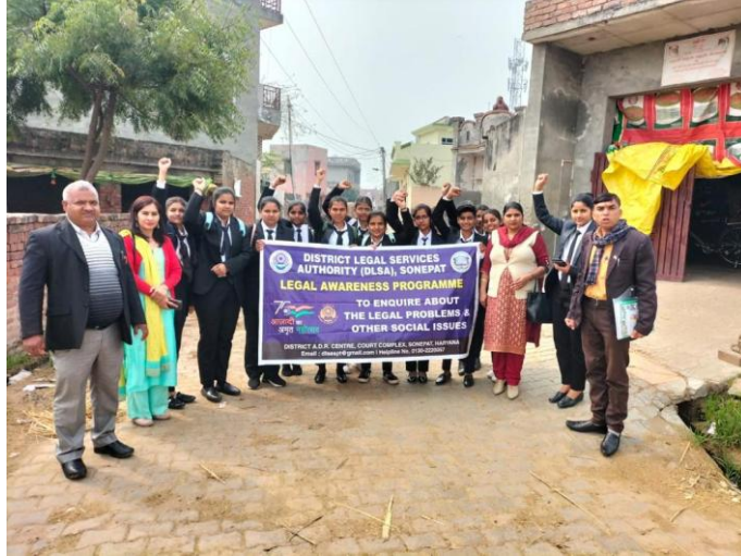
Legal Literacy Camp in village kakana by Students of Department of Laws BPSMV Khanpur Kalan Sonipat on 23 February 2022 ( morning)