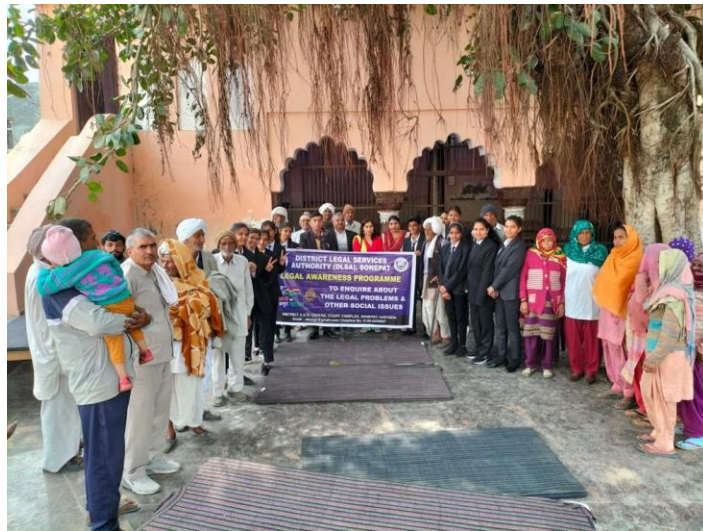
Legal Literacy Camp in village Nyaat by Students of Department of Laws BPSMV Khanpur Kalan on 23 February 2022 ( Afternoon)