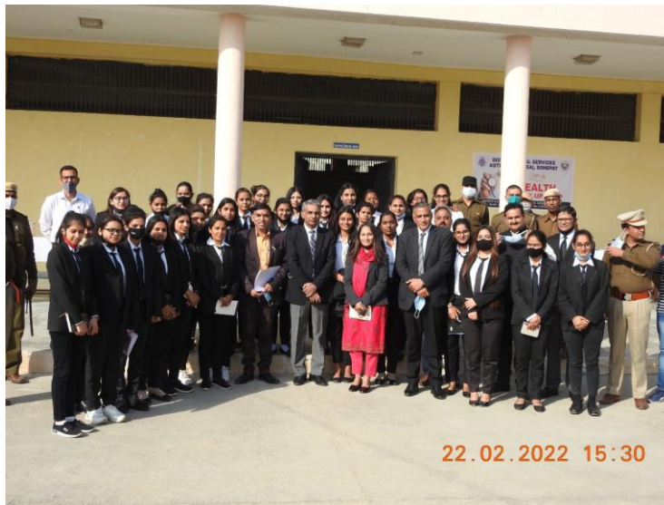
Legal Awareness-Cum- Service Camp at District Jail, Sonapat in Cordination with Law Students of BPS Women University, Gohana and other Government Departments.*